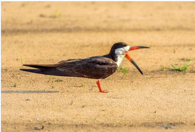
Black Skimmer

The area of the Pixaim River at our lodge also boasts two pairs of very habituated and photogenic