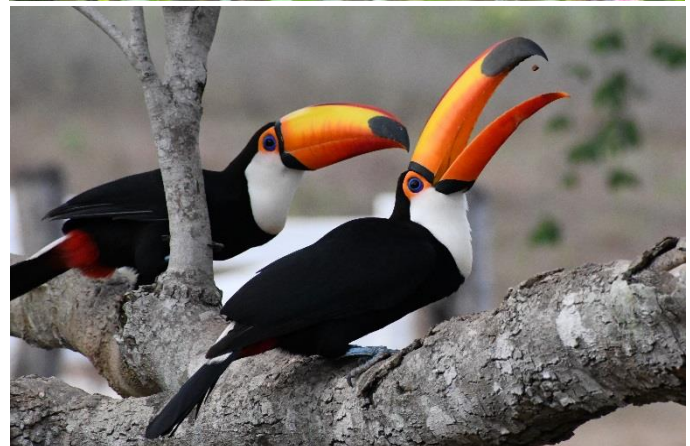
Jaguar, Giant River Otter, Toco Toucan