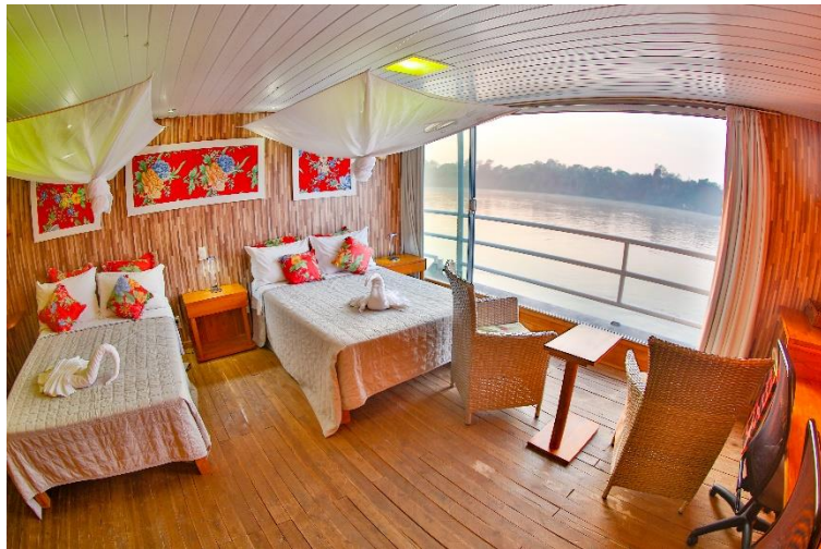
A suite on the Jaguar Flotel

While we are staying on the Flotel, we use the larger suites on this tour. Each room with very large windows and a great view over the river as shown here.